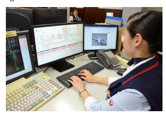
Smartwatches provided by NTT DOCOMO, INC.