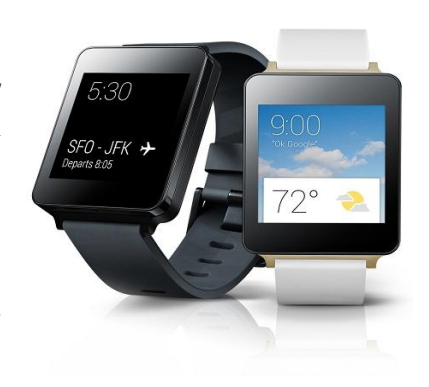
LG G Watch

JAL strives to provide customers with new and innovative products and services under the banner "Embrace new challenges JAL".